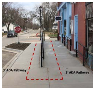
Fig. 1 Two ADA Pathways Required

Each block and each side of the street in the Central Business District (CBD) have different total widths measured from the building façade to the face of the street curb. There are areas as well where two different ADA Pathways are required to access a business and to allow access to the street crossings, which substantially reduce any effective area for merchant use of the sidewalks. See Fig. 1